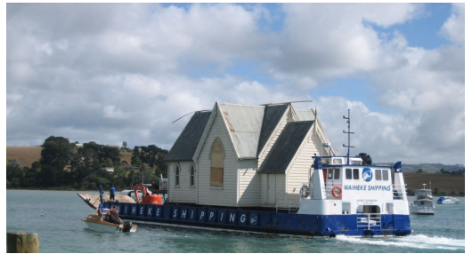
St Andrew ‘On sea’

In April, we visited Melbourne as the guests of some dear generous friends who made available their 5 th floor apartment at Beacon Cove (below), Port Melbourne (and a spare Range Rover). From this vantage point, we