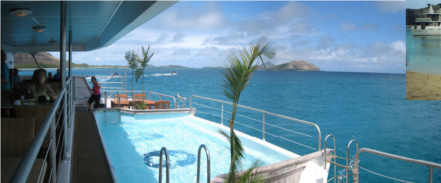
Swimming Pool on the stern of the Fiji Princess